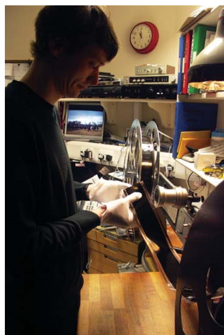
Checking a 70mm print